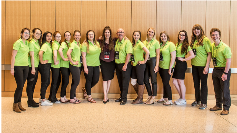
The 11 members of the 2017 ESYF gathered at the 23rd Skills Canada National Competition.

participants focused their attention on the newly created Essential Skills Work Ready Youth Program.