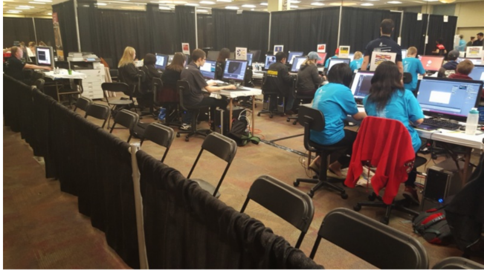
Ricoh MFPs in use at the 23rd Skills Canada National Competition.

With Ricoh Canada's expertise in capturing, managing and transforming information, we were able to deliver a broad portfolio of services to Canada's talented youth as well as their family and friends.