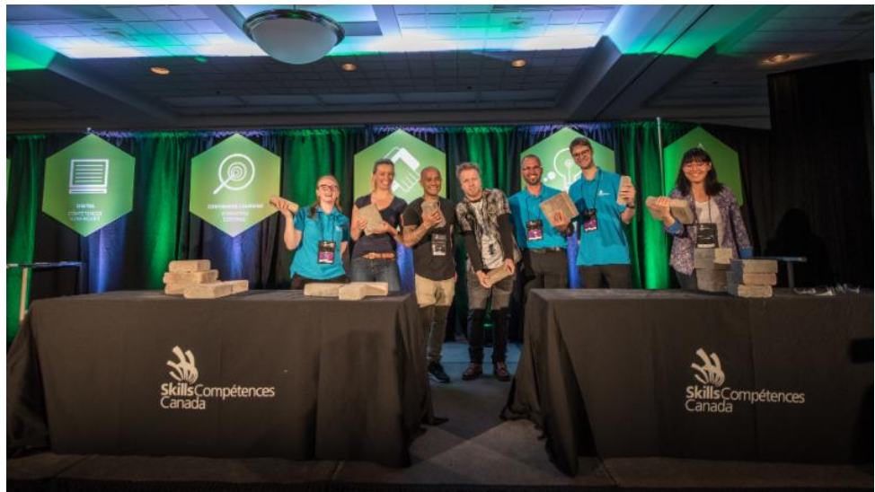
Celebrities, SCNC Presenting Partners and SCC alumni participated in the Official Launch of the 23rd Skills Canada National Competition.