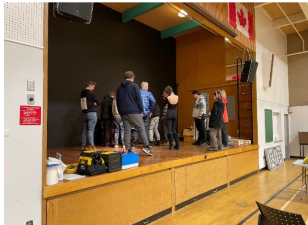
Glacierview Alternate School – November 9 th - Day one “On Stage” with 14 students that will be participating for the first time in a woodworking elective at their school. They started clearing the stage in the gym as that was the only place in the school large enough to setup a “small shop space”. There will be locking cabinets, a portable table saw, mitre saw and a few other pieces of equipment along with a portable dust extraction unit eventually setup. As a group, day 1 included learning how to put a mitre saw and stand together without the teachers help, going through electrical requirements and making sure there was enough power to run the equipment, talking about trades and the safety aspect of working around machinery.