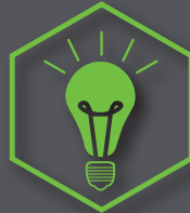
CREATIVITY & INNOVATION

Your ability to imagine, develop, and encourage, ideas in ways that are new. For example, we use this skill to discover better ways of doing homework, school projects and our house chores by finding ways to make them more enjoyable.