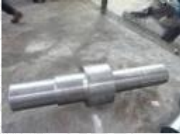
PROPOSED TURNING EXERCISE