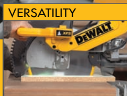
VERSATILITY Exclusive Back Fence Design cuts up to 2x16 dimensional lumber at 90° and 2x12 at 45°