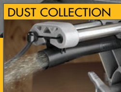
DUST COLLECTION Super efficient dust collection system captures over 75% of dust generated