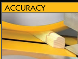
ACCURACY XPS™ Cross Cut Positioning System Make accurate cuts without needing to check alignment of a laser