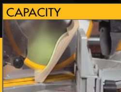
CAPACITY Tall sliding fences support Crown Molding up to 7-1/2" nested